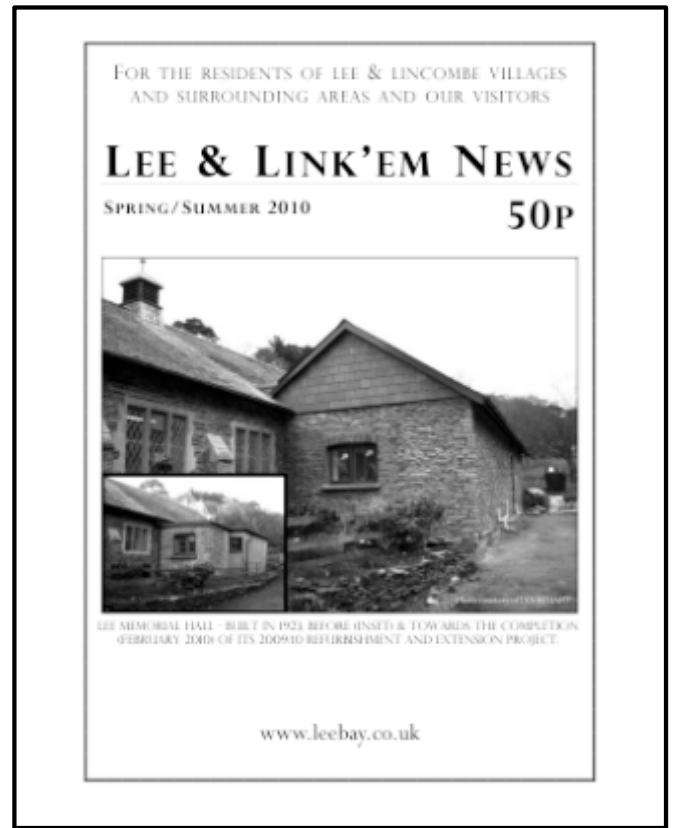
SPRING/SUMMER 2010 - Memorial Hall renovations

P.S. Don't forget we have the archive back to Summer 2005 available online: https://loveleebay.co.uk/archive