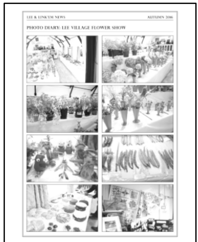
AUTUMN 2016 - Lee Flower Show photos from 10 years ago