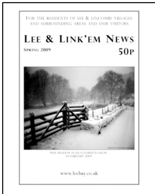
SPRING 2009 - Snow comes to Lee on 3 rd Feb 2009