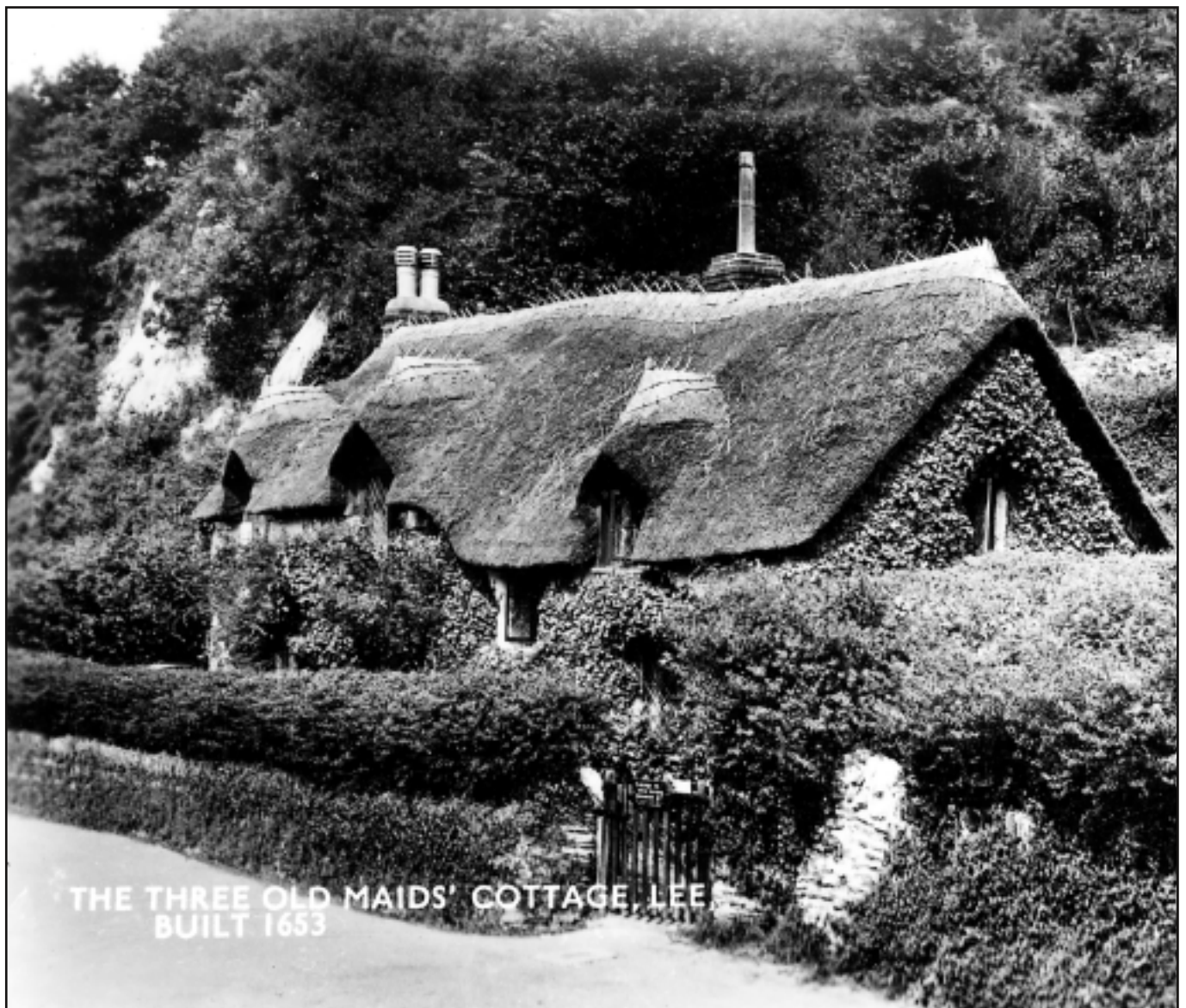
THE OLD MAIDS' COTTAGE IN THE CENTRE OF LEE VILLAGE (UNDATED - FROM MRS. L MONEY'S COLLECTION)