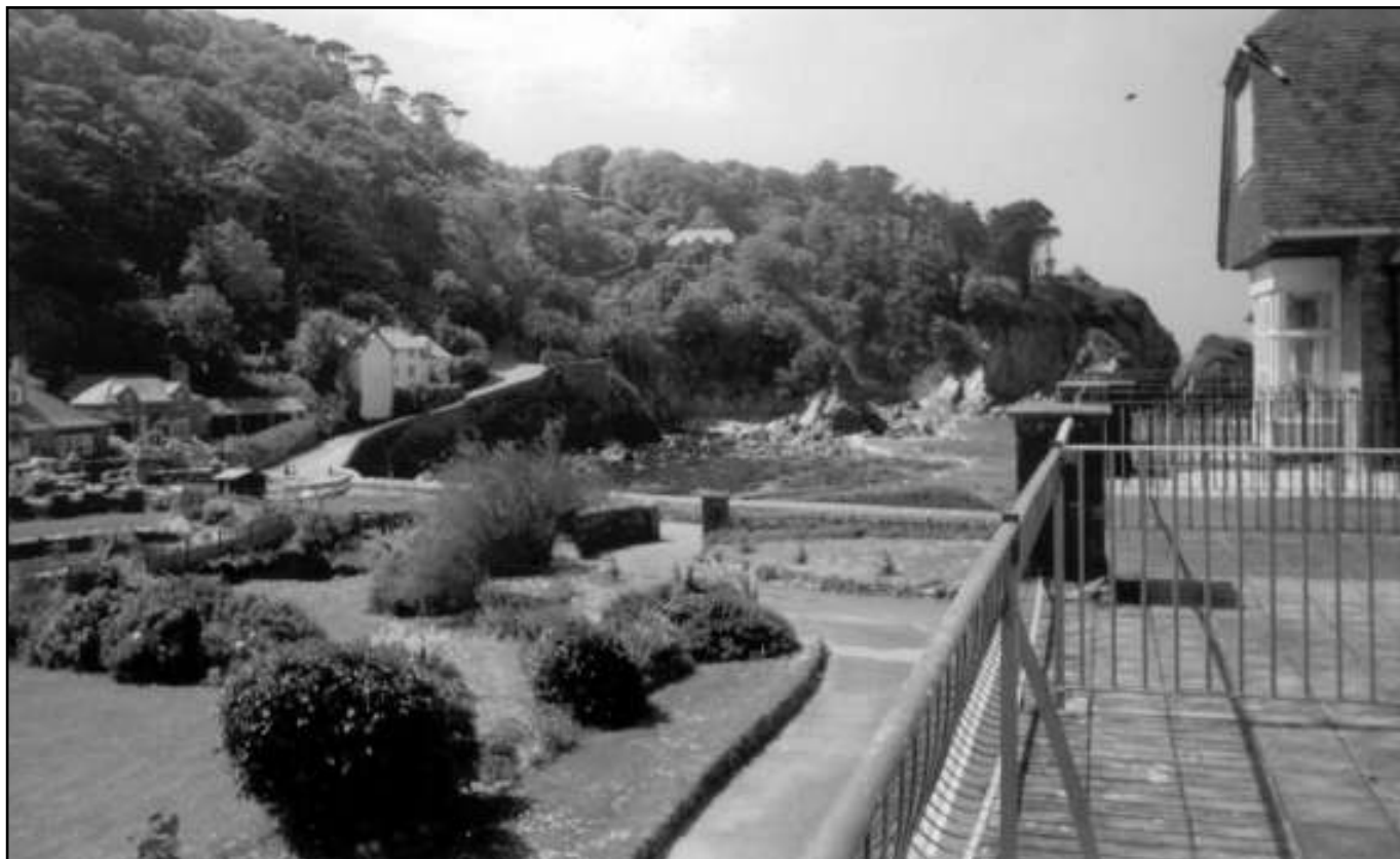
A holiday snap from the Lee Bay Hotel balcony back in 1999.