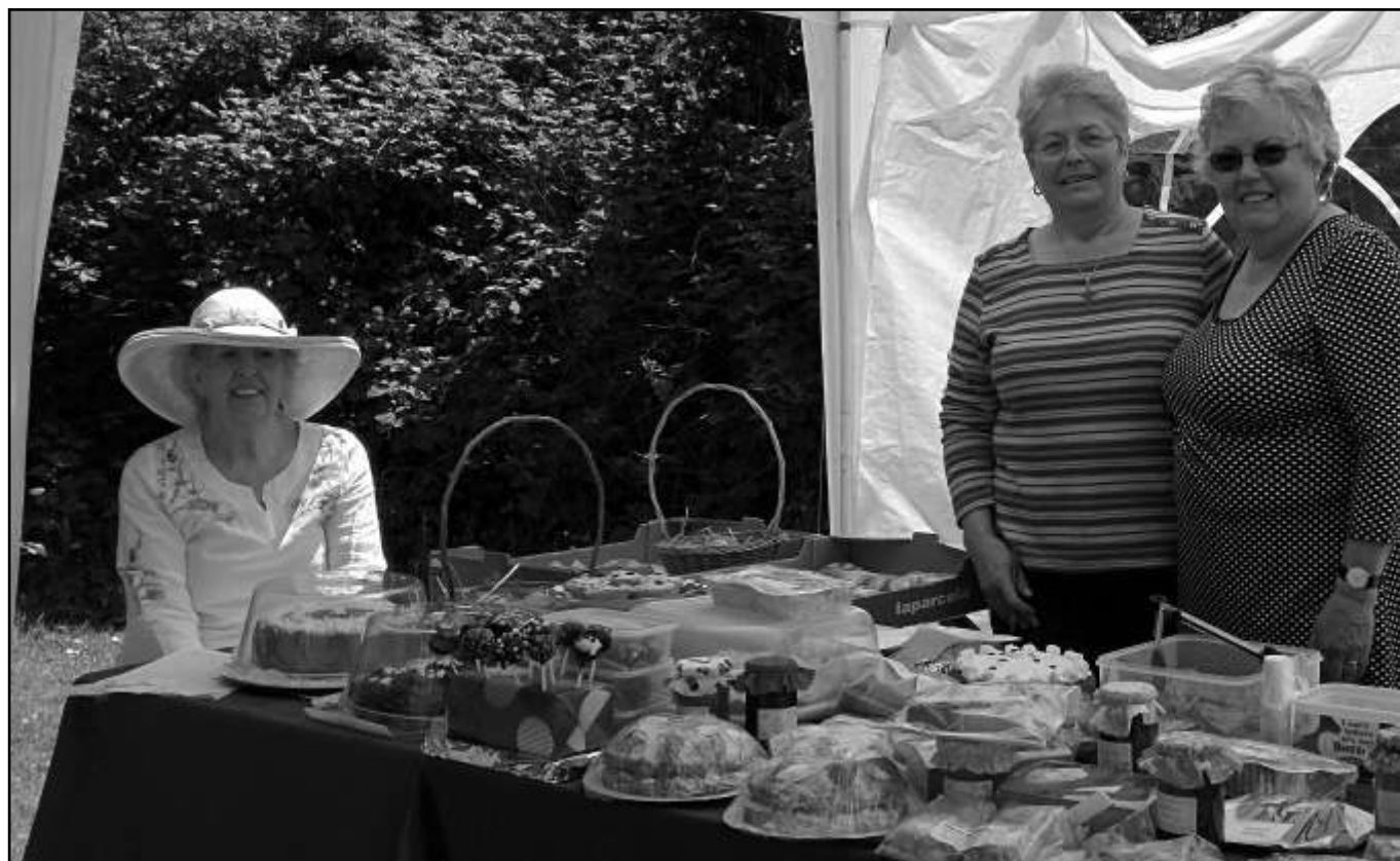
On the cake stall, the ladies guard the vast array of delights on offer before everything disappeared very quickly.

A huge THANKYOU to everyone who took part and made the event possible and to everyone who came along – we could not have done it without you!