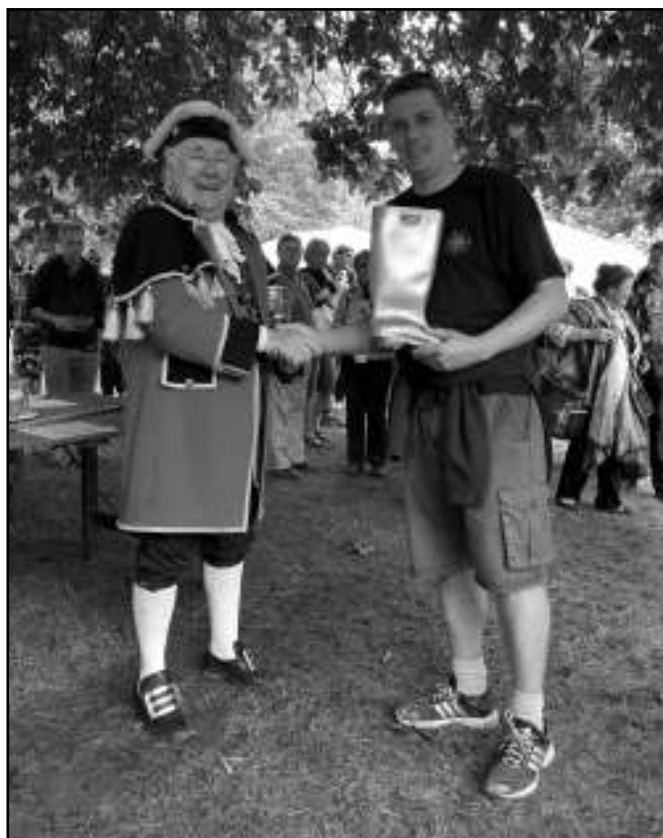
The adult winners of the new Welly Wanging competition are presented with their golden welly trophies.